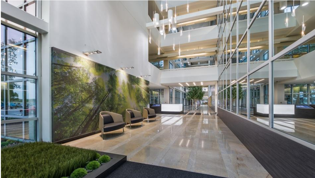
100/200 GALLERIA / PUBLIC SPACE / SOUTHFIELD, MI