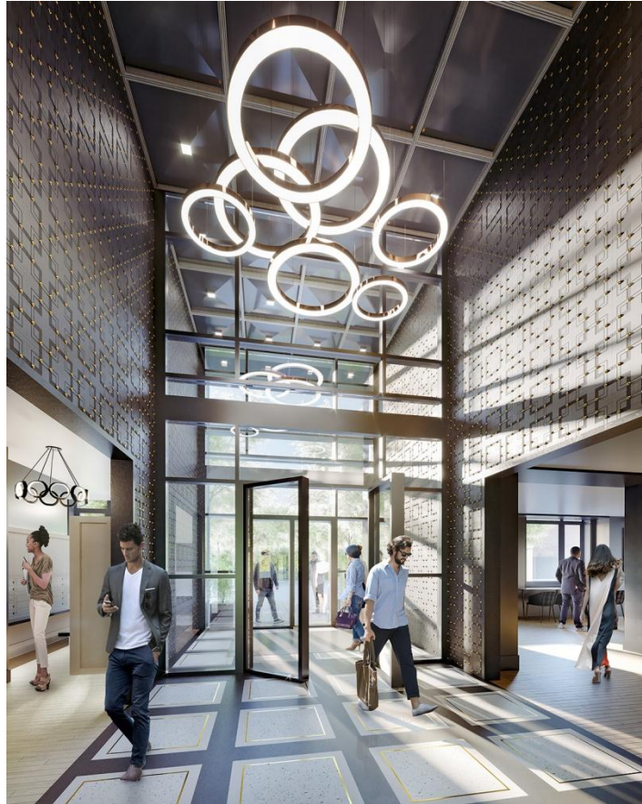
THE VITAGRAPH / MULTI-FAMILY / BROOKLYN, NY